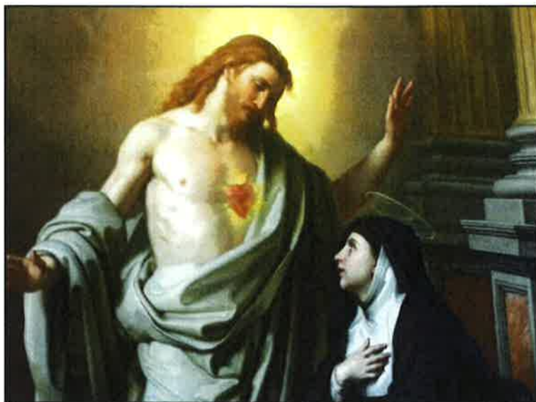
Apparition of St. Margaret Mary Alacoque of the Sacred Heart of Jesus